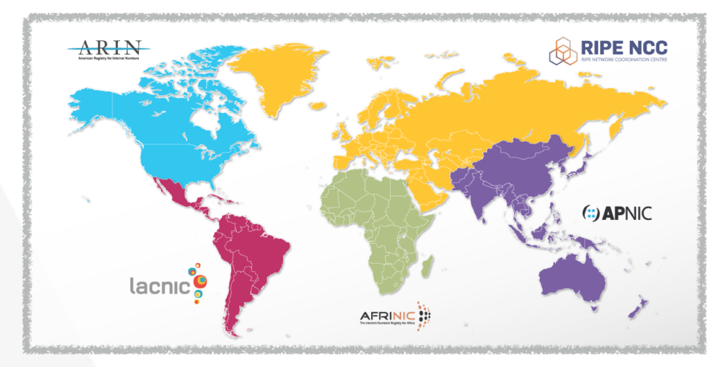
Regional Internet Registries (RIRs) and their respective service Regions