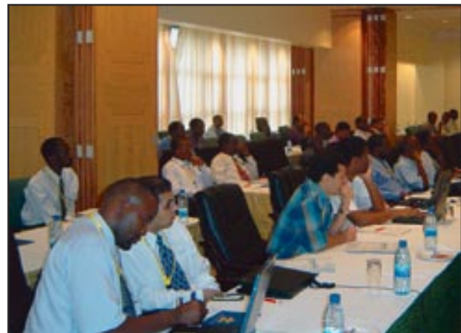
ARIN Regional meeting attendees